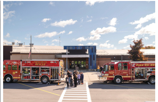
With the help of local volunteer fire departments, students at APW Elementary School learn about fire safety and prevention.