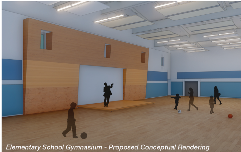
Elementary School Gymnasium - Proposed Conceptual Rendering